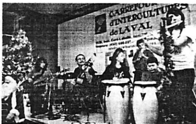
Laval MPs and an MNA attended the Carrefour d'Intercultures' Christmas party last month.

It also aims to sensitize Quebec society to cultural diversity. The CIL plays a pioneering role in the management of diversity, intercultural dialogue and reconciliation, while respecting differences and promoting the common values of Quebec.